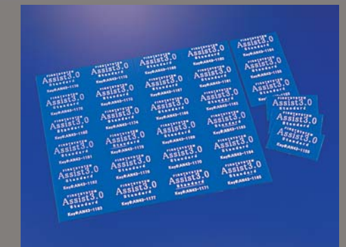
Software : Dr.Engrave