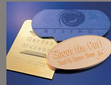
Software : Dr.Engrave