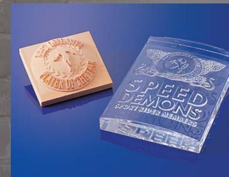
Software : 3D Engrave